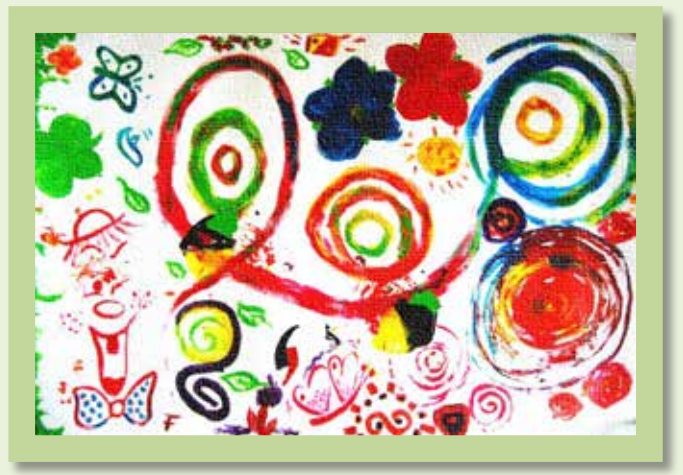
This image has been painted by Young People with MS during the EMSP Youth Congress 2011

MS affects all participants whether as a person with the condition, working for a national society or a volunteer. The discussions were broad, enthusiastic and gave everyone a chance to hear of the experiences in other nations. Our lives are all enriched when we share ideas and create the energy for positive change in our respective countries. The energetic discussion and relationships begun in 2010 have continued in Brussels. Now the EMSP and all participants have an opportunity to work together and improve the lives for all Young People with MS.