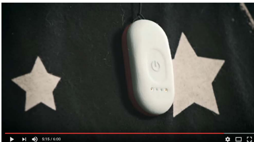
A closer look at the MEMS transmitter