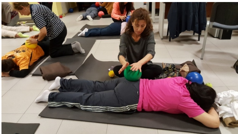
The training sessions for MS carers were held in AEDEM's Training Centre in Madrid