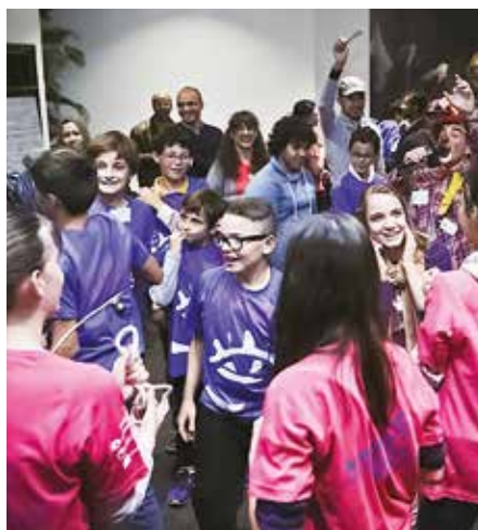
France: An information day for children with MS and their families.

Although MS will sometimes make certain sports or activities more difficult, children with MS should not feel they need to stop being active and rest all the time.