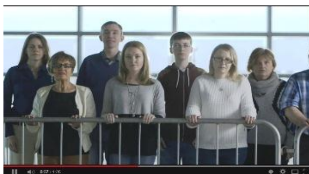
EPF 2014 EU Elections Campaign - The Official Video!

Click here to read more and on the picture below to watch the official campaign video: