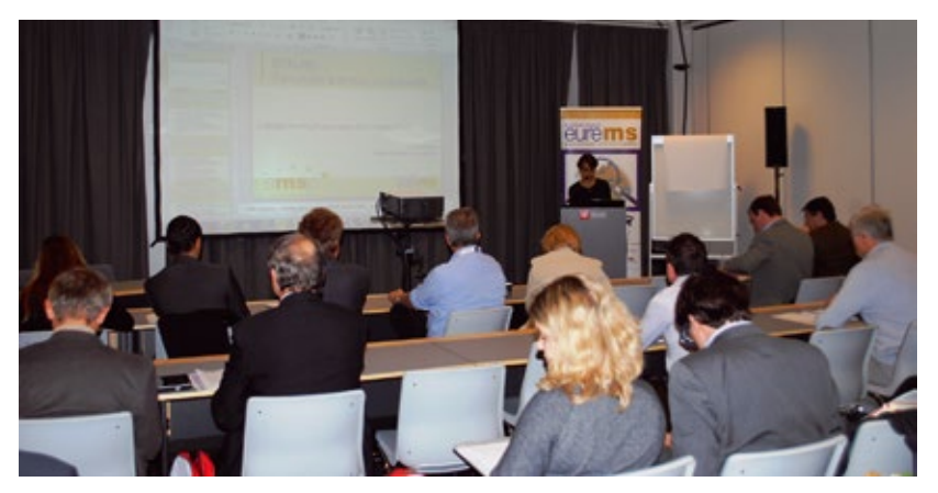
EUReMS Meeting held at ECTRIMS 2013, in Copenhagen, Denmark

The results of this survey were presented at the 2013 Congress of the European Committee for Treatment and Research in Multiple Sclerosis (ECTRIMS), held in Copenhagen, Denmark. They were later published in the Multiple Sclerosis Journal in April 2014.